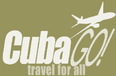
Logo for the campaign to end the travel ban on Cuba.

Often I think of our work as being centered on justice. This year I felt our watchword was also freedom.