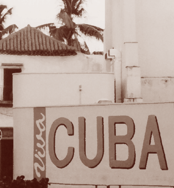
Street scene in Cuba.