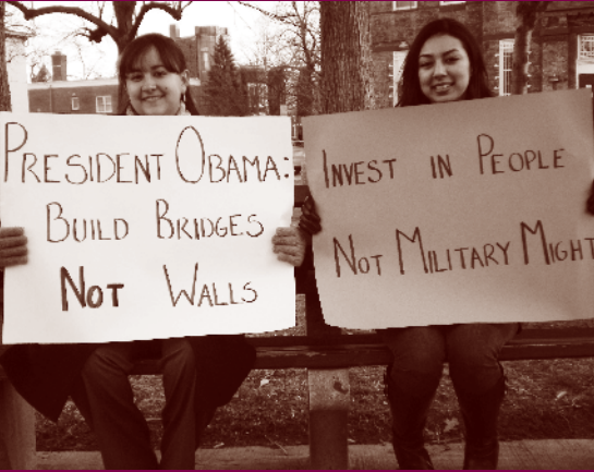
Activists send Obama a message through LAWG's photo campaign.