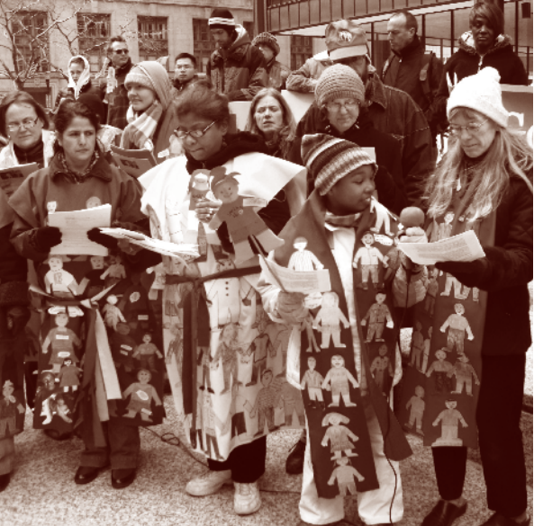
Advocates in Chicago wear dolls on prayer shawls and read a “Grieving Mothers” liturgy to mourn the displacement in Colombia.

to expose the wiretapping scandal, President Obama raised the issue with the President of Colombia and Congress placed some provisions in law restricting funding to the agency that had conducted the spying.